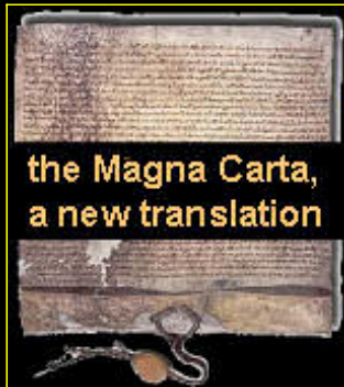
the Magna Carta, a new translation

{p.433} [VOL. LIX. No.236.] [October, 1950]